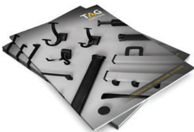
DESIGNER INSPIRATION BOOK