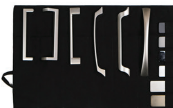
DECORATIVE HARDWARE + FINISH SAMPLES