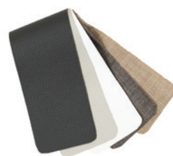
LEATHER & FABRIC SWATCHES