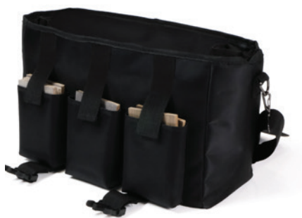
SHOULDER BAG + EXTRA POCKETS FOR SAMPLES

Take this valuable showroom experience direct to your client ... with the new TAG Hardware Designer Bag, complete with Designer Inspiration Book , double-sided Display Kit, product samples and swatches ... all in an easy-to-carry shoulder bag.