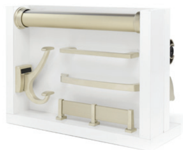
DOUBLE-SIDED DISPLAY KIT (SIDE A)